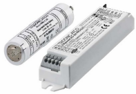
Emergency power gear